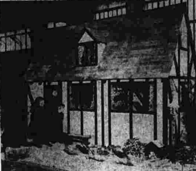
This scale model of Prince Elizabeth's new home shows it to be a ten-foot high, the house boasts a well and doghouse.